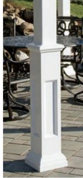
5x5 Superior Post