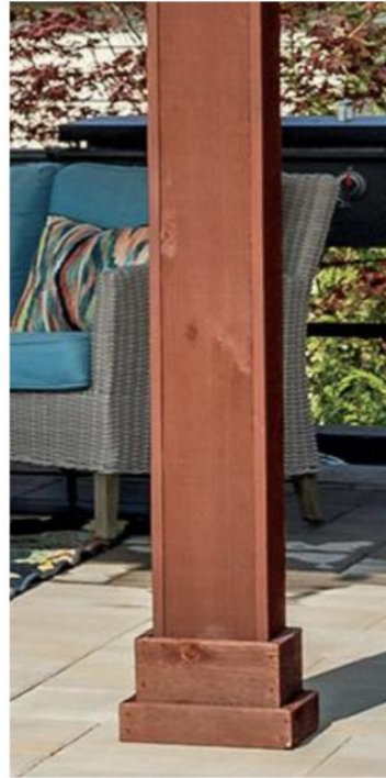
8x8 Wood Post