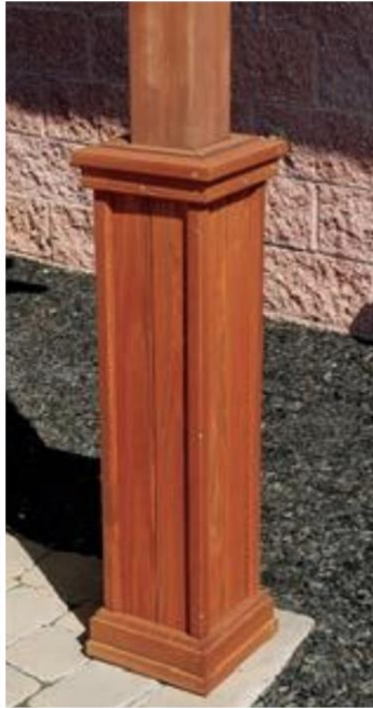
5x5 Superior Post